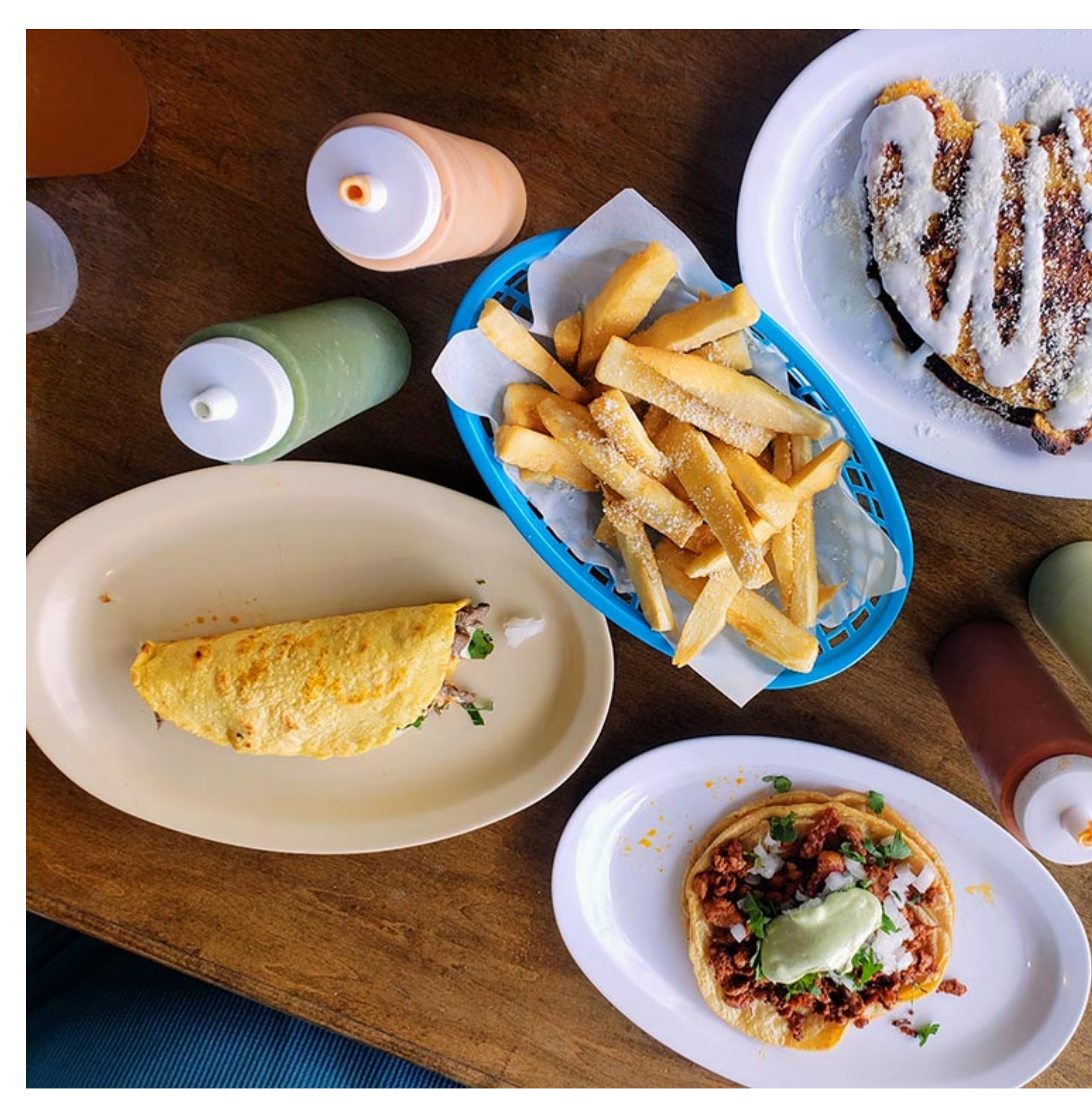
Mi Pana Latín American Cuisine 2241 Highland Ave, National City, CA 91950

Mi Pana Latin American Cuisine offers a combination of Venezeluan, Colombian and Mexican foods. Our personal favorite is the cheese cachapas, a sweet corn pancake filled with cheese. Take Route 929 to Highland Ave & 21st St to sample their tasty menu.