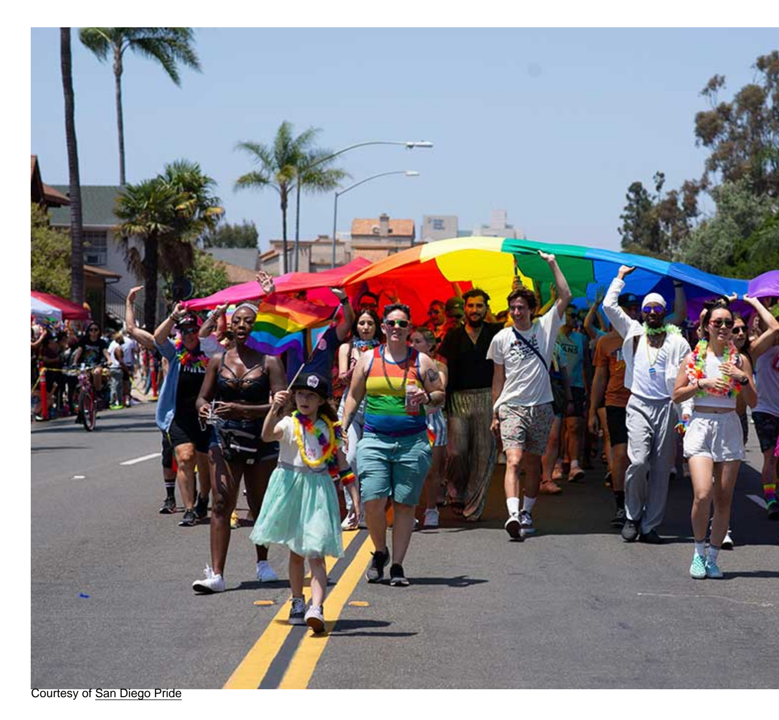
8. San Diego Pride Parade and Festival