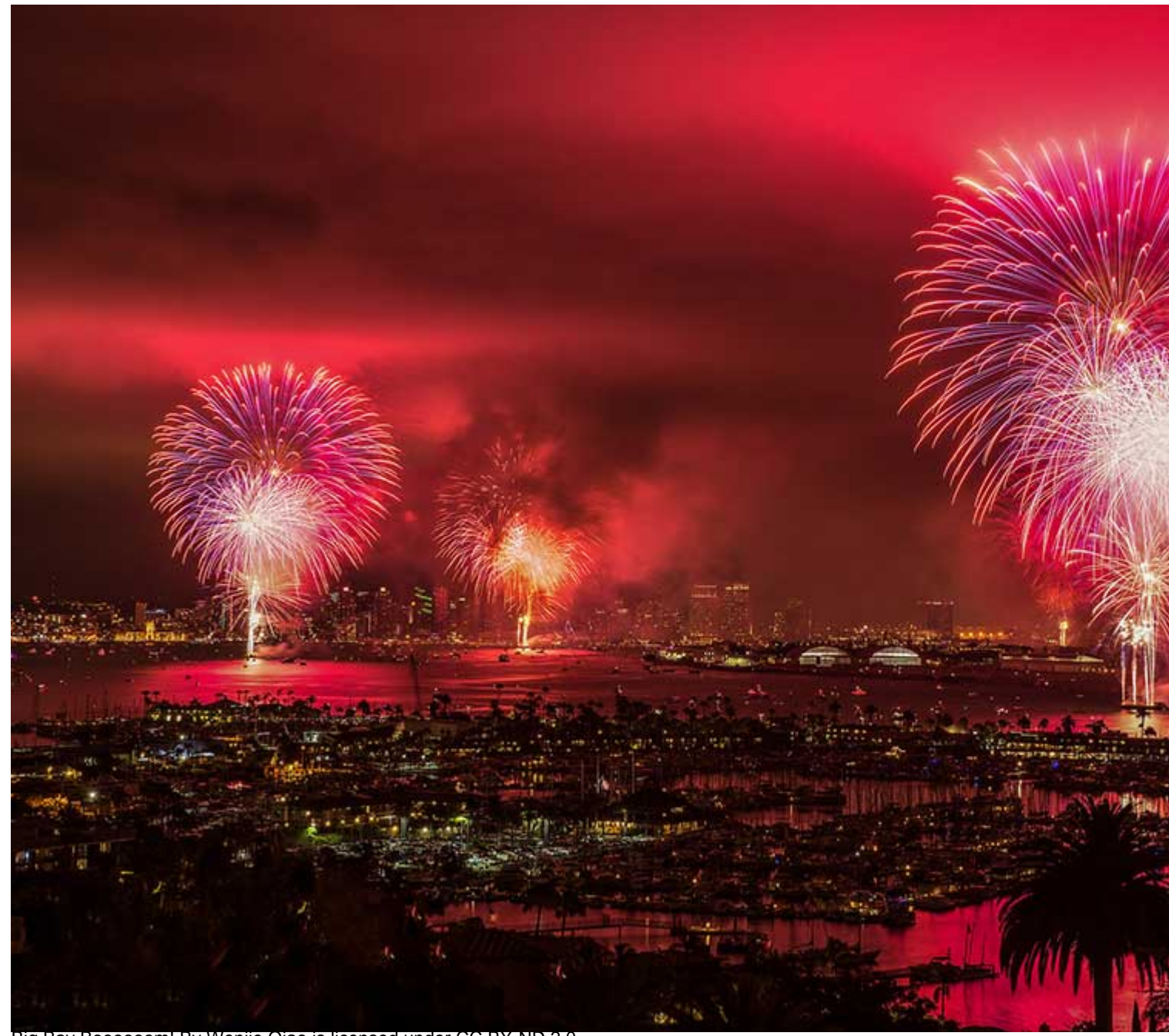
Big Bay Boooooom!

. Take the Trolley so you can spend your time exploring instead of trying to park in one of the few parking spaces available in Old Town.