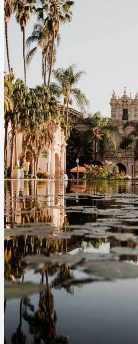
From left to right: Photo by Intricate Explorer on Unsplash | Photo by Zane Persaud on Unsplash