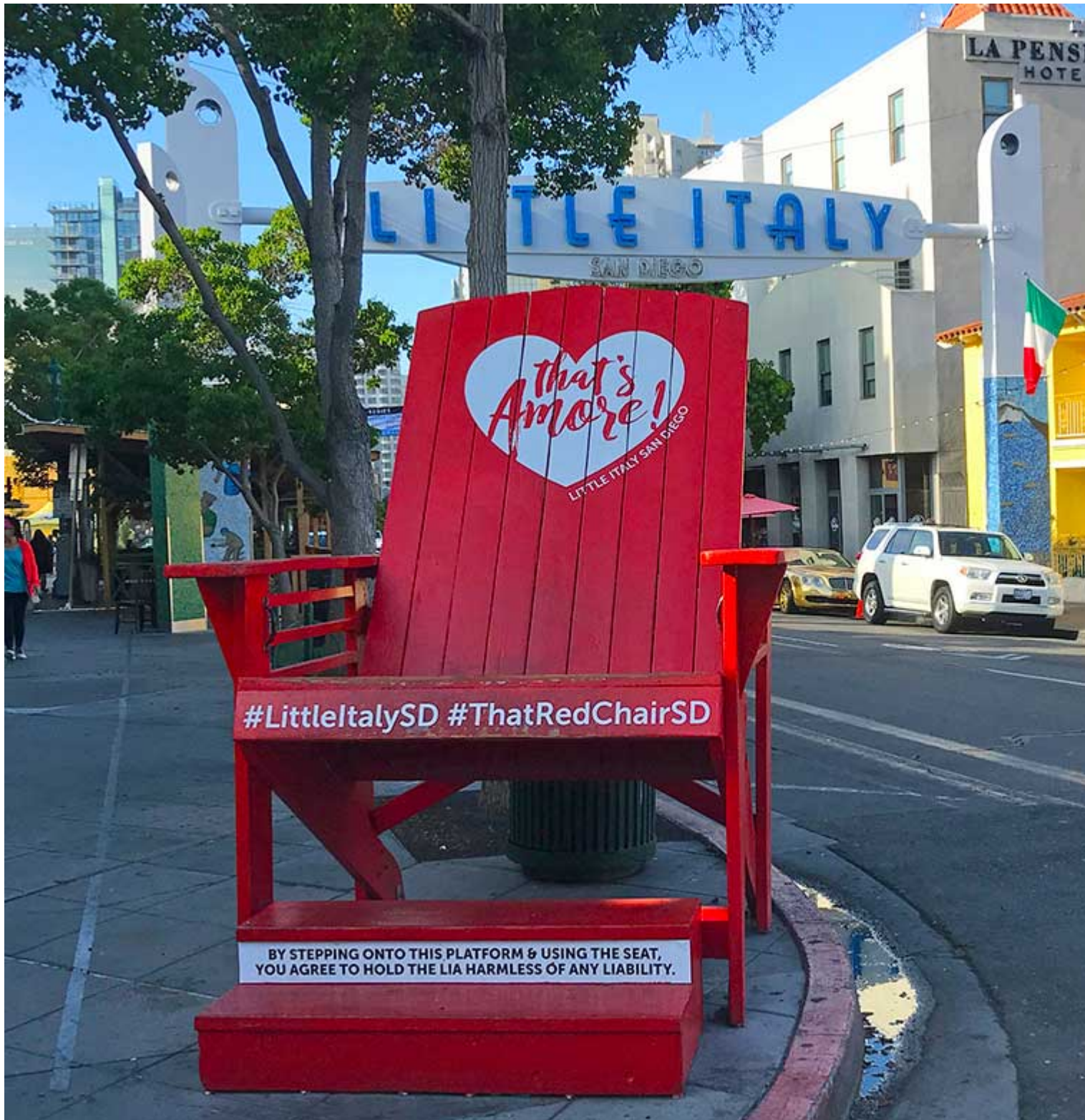
Photo by Kirk K - "That Red Chair" is licensed under CC BY-ND 2.0 .