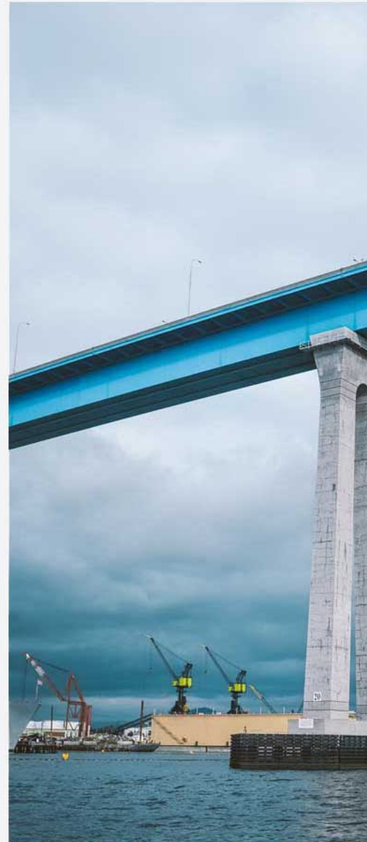
(Left to right)

After breakfast you can hop back on the Trolley to Santa Fe Depot and walk to Coronado Ferry Terminal for a quick 15 minute ferry ride to Coronado. Riding the ferry is a fun way to check out the bay on the cheap! Check out our blog post about where to go in Coronado via Route 904 (free from June 11th to Labor Day).