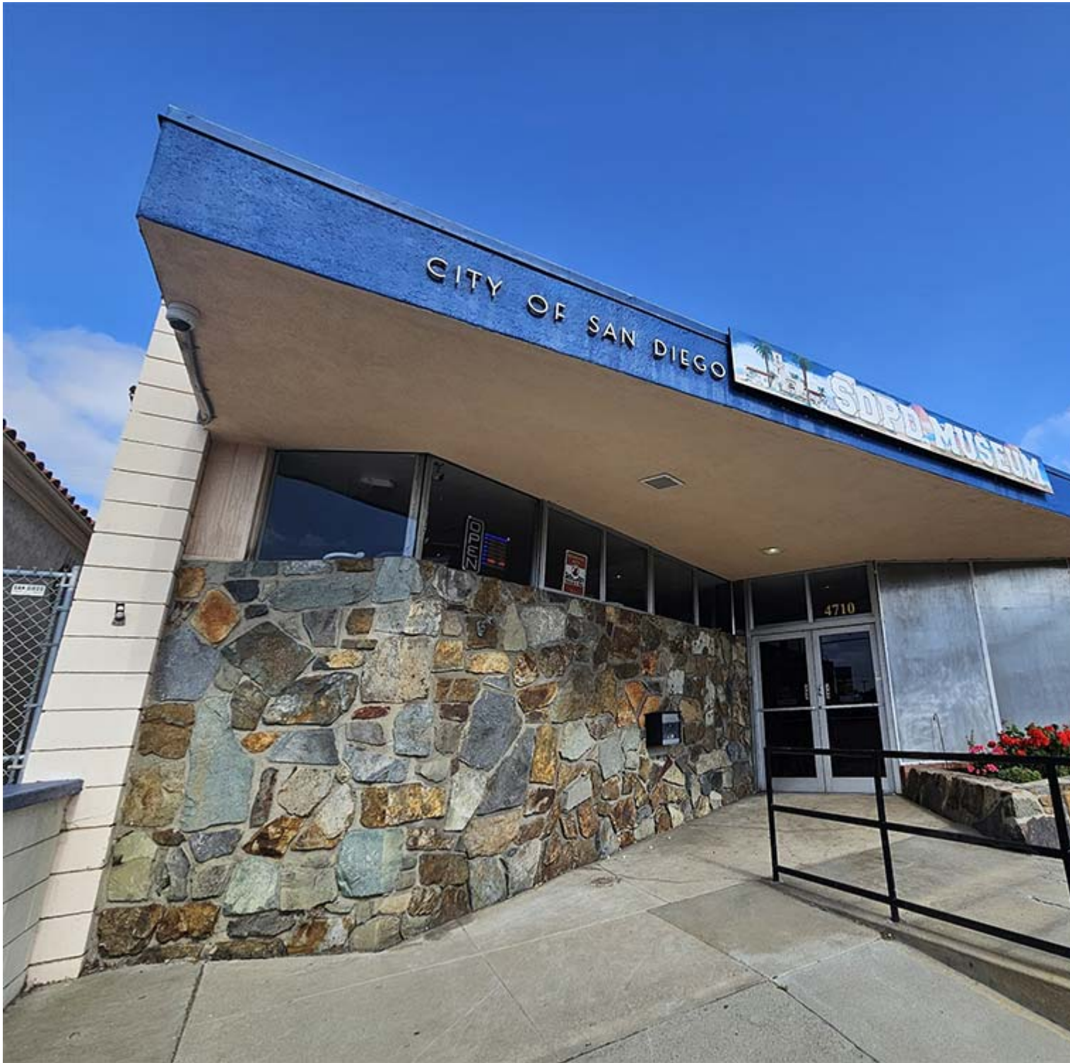
San Diego Police Museum