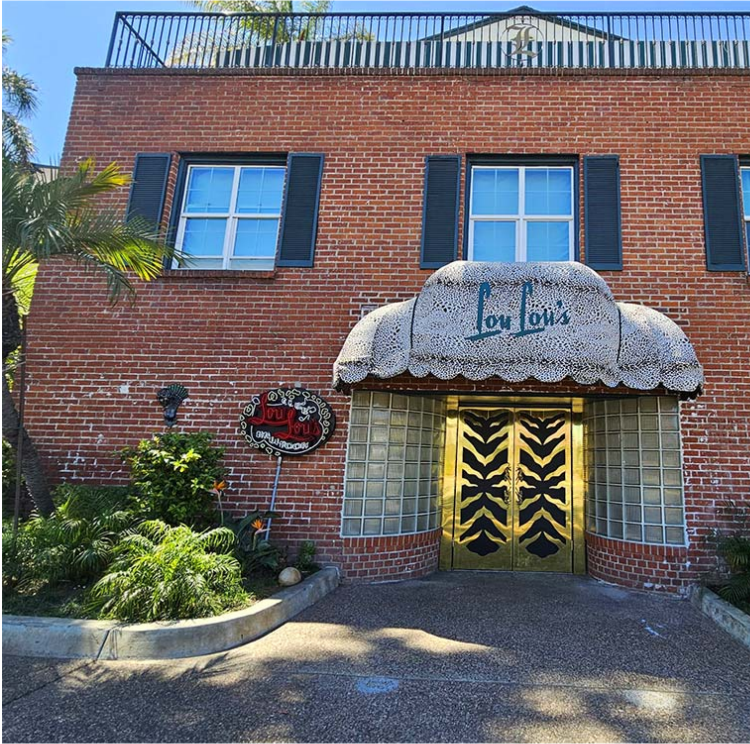
Lou Lou's Jungle Room