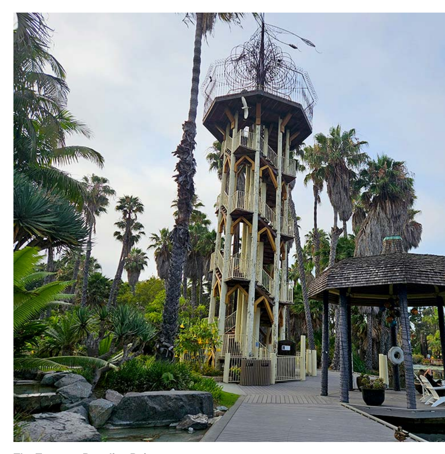
The Tower at Paradise Point