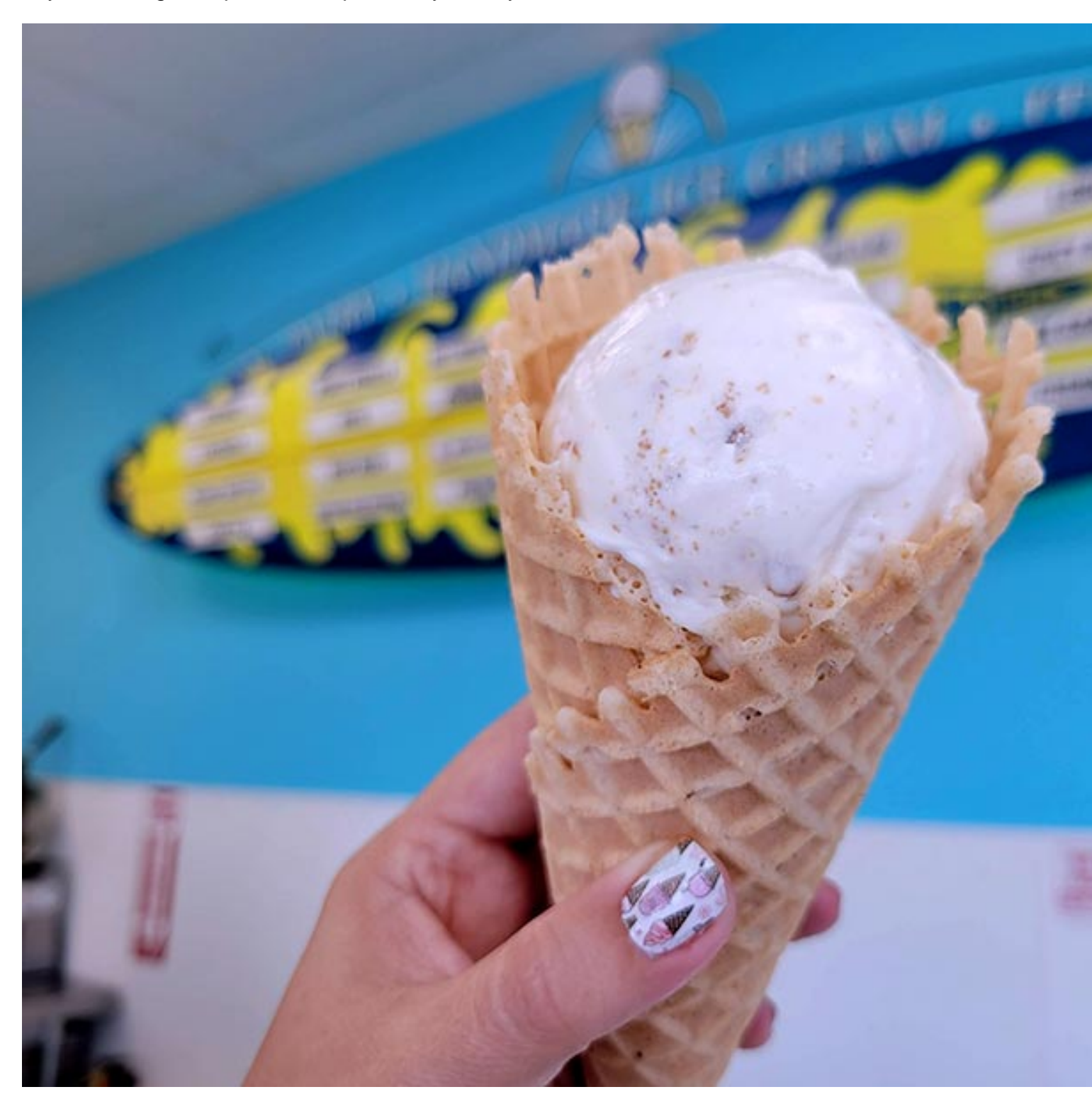
Pacific Beach Ice Cream Company

sandwiches for breakfast and lunch. Located just a couple of blocks from either the beach or the bay, this is a great spot to fuel up before your day at the beach.